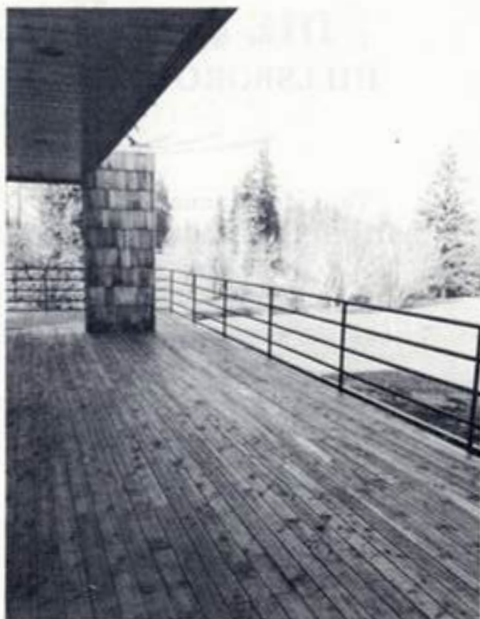
For dining outside in summer weather.