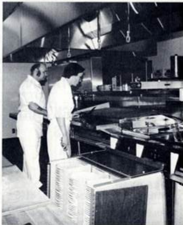
Cooks at work

LOCATION: 3010 S.E. TUALATIN VALLEY HWY. HILLSBORO, OREGON 97123